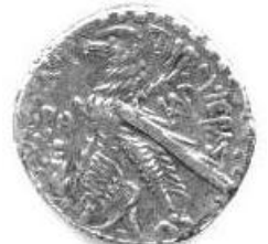
KP JERUSALEM MINT (New Style)